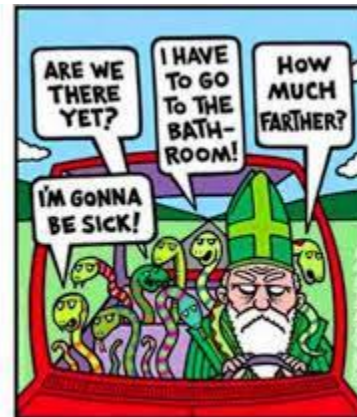
St. Patrick driving the snakes out of Ireland.